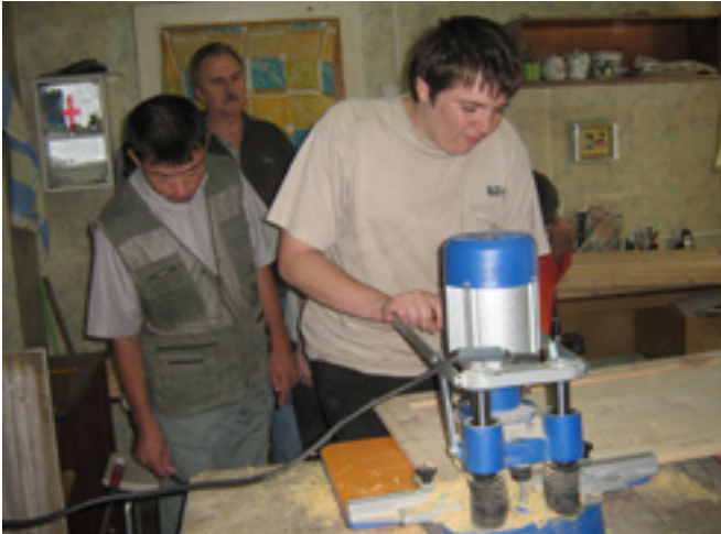
Handicrafts workshop. Photo of the "Umidvorlik" Centre

was made possible by dvv international Uzbekistan, which has supported our proposal to establish this workshop.