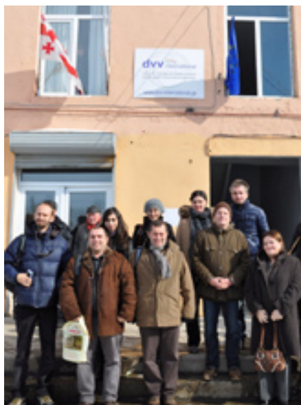
Participants of the trip to Koda. From left to right in the first row: Representatives of Turkey, Azerbaijan, Armenia, Germany and Georgia.

The Koda Education Centre is implementing various programmes as on vocational orientation as well as personal development (more than 20 different programmes overall). It also supports the development of social enterprises for IDPs and other socially vulnerable groups, as well as various programmes for children and young people to engage in the cultural community life. The result of 2011: 8 successful projects, 1967 beneficiaries and 64 employed trainees (including self-employment).