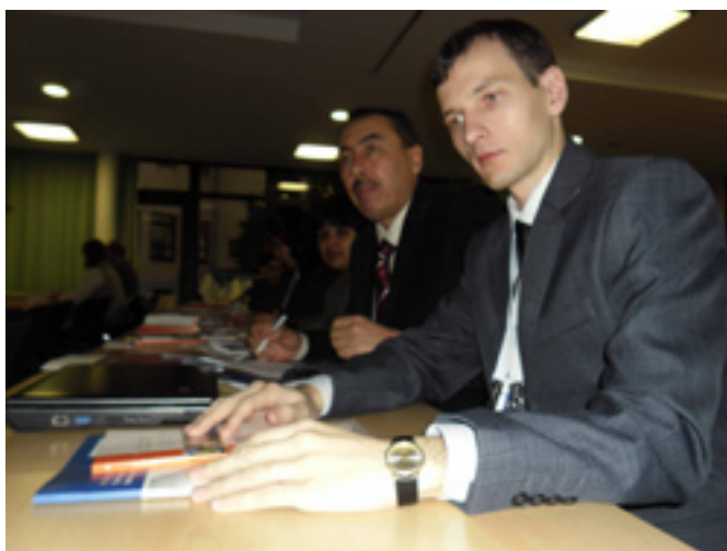
BoCAED participants from Uzbekistan.