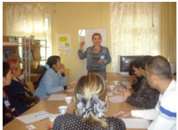
Training of «ATLASKO-EDU» for patents and trustees, «SOS-Child Villages», Tashkent 2011.

The state supports the development of youth, the introduction of ubiquitous computing and media technology, which leads to lack of competitiveness of retirees and experts with valuable experience over 25 years at the labour market. After all, whatever the innovation, without professional experience and life wisdom they cannot find its best practical use.