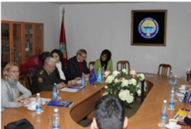
Official kick-off meeting.

The beneficiaries of the project are state structures of the Penitentiary System involved (Ministry of Justice, State Service for Penal Execution, institutions, VET-Agency), families of the convicted, general population, prisoners, serving sentences in the present and potential convicted in the future.