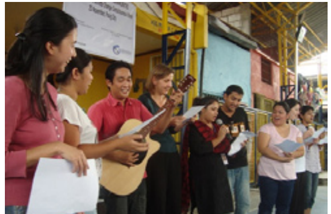
NeXT-2 Programme. 22 th -28 th November 2011 Philippines, Manila.

The NeXT-2 programme (Regional Training on Adult Education Advocacy) as well as other training programmes of ASPBAE is aimed at promotion of “Education for All” and “Lifelong Learning” Concepts, realisation of general right for training of vulnerable population.