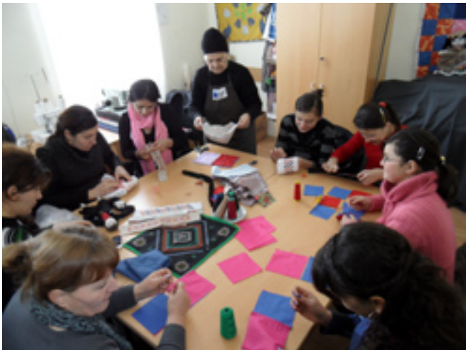
Courses on patch-work.

persons are persons falling within the definition of refugees, but who, after having left its place of residence, remain in the country of its nationality and can benefit from its protection.