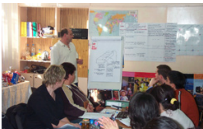
Seminar of «ATLASKO-EDU» for its employees.

Employers lose interest to employees whose age is close to retirement age, and especially to those who have already retired. Meanwhile, it is a very difficult period of socialisation. It is the period, when a person stops working, he often feels useless to the society and people around him. The usual pace of life is difficult to reverse overnight. Ones feel lost and useless on the retirement, miserable, start to hurt, look for conversations, and can't apply their knowledge and experience. The others are waiting for retirement because they anticipate with relish the freedom and extra time for favourite activities and hobbies.