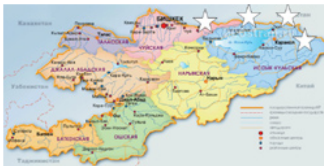
Regional range of the project

customers on marketing of products. Thus, households will increase the possibility of income-generating activities. In addition, four of the local ATC members of KAEA will increase their portfolio and their presence in the remote areas of the Issyk Kul region. There is also a plan to involve at least 200 representatives of local authorities, self-help groups, NGOs and companies in the development of efficient mechanisms for the sustainable development partnership of the project area.