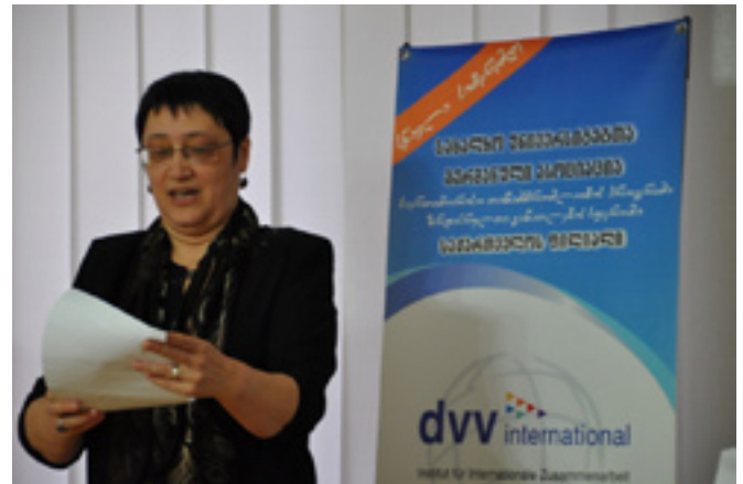
Official congratulations.

Ministries and other partner organisations. The third event was a nice housewarming of both Georgian national and regional offices at the address: Tbilisi, Kipshidze str., 20.