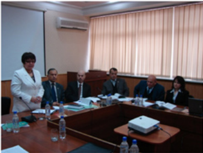
International Round table.

As a result of the National Report on 15 th December 2011 an international round table with a representative of the UN Secretariat for Economic and Social Affairs, employees of the Ministries and departments, NGOs and the media was implemented. At the end of the round table a resolution containing recommendations for improving efficiency of the state policy on aging was adopted.