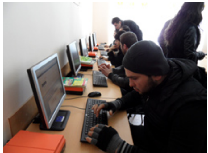
Computer courses.

At the next day representatives of national offices of dvv international were invited to the Koda village (27 km. from Tbilisi) to visit the Educational Centre for local community, established with the support of dvv international in January 2010 in the framework of project «Support to the socio-economic integration of IDP-persons in Kvemo Kartli region» co-financed by the European Union. As an independent organisation the Centre began its work in November this year.