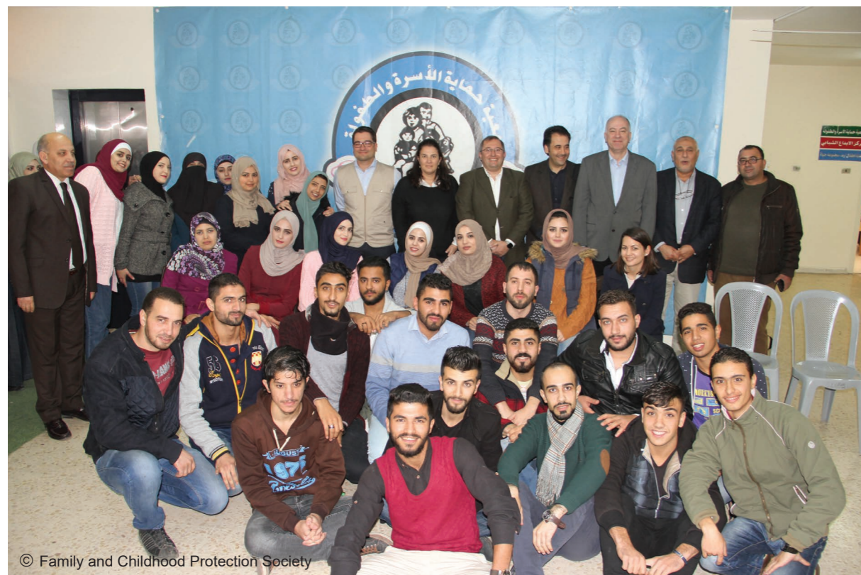
© Family and Childhood Protection Society

A variety of approaches practised in ALE projects are presented in previous examples. They are often based on the individual needs and previous experiences of participants of what helped them not just to get professional skills but to develop abilities to practise those skills. Examples of ALE projects developed based on the needs of Women in India, the Mujawarat - Neighbourhood Project in Gaza, the Mobile VET project in Lao PDR, literacy projects in Egypt and in Cambodia, and Projects for Syrian refugees and vulnerable Jordanians, all show the potential of ALE. Participatory approaches based on dialogue are strong instruments to empower and emancipate marginalized people. There are thousands of other ALE projects implemented in many countries, by organisations big and small, local and international, which display similar or even more convincing results. However, ALE is not implemented systematically.