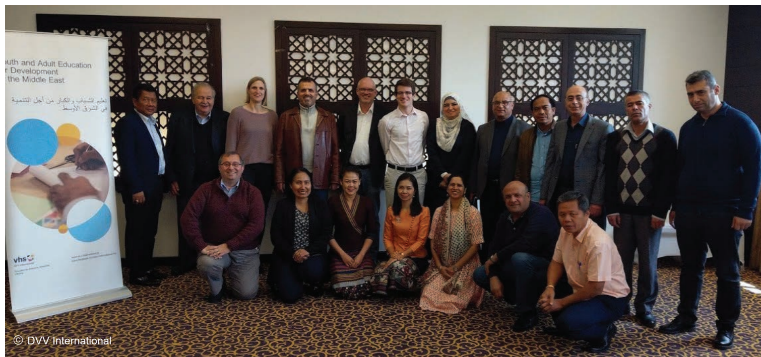
Expert Working group in this project: Reaching the Marginalized – Good Practices in ALE