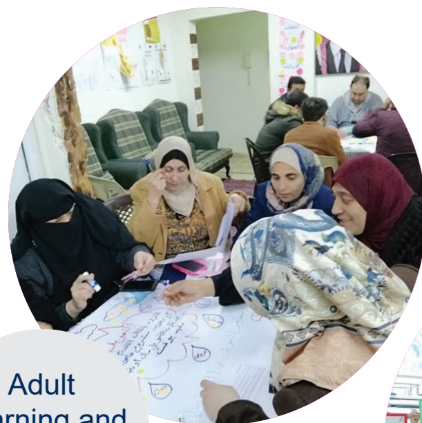
Adult Learning and Education in Jordan

The studies show the importance of understanding the dimensions and complexities of poverty. This means getting to know more about coping strategies in order adequately to understanding the dynamics of the poor in dealing with poverty. This should contribute to developing better interventions, and facilitate the collaboration of decision-makers, civil society and development partners, ultimately to ensure that adult education approaches are more efficient in strengthening marginalized peoples.