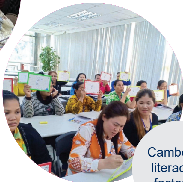
Cambodia: literacy in factories